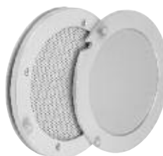
6" (152 mm) Model with Metal Cover