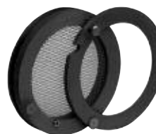
4" (102 mm) Model with Lucite Cover