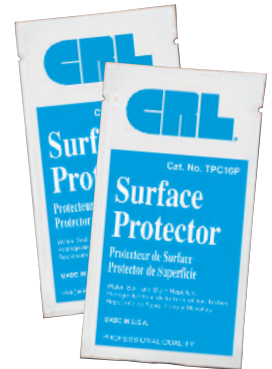
CAT. NO. TPC16P

CRL TPC Surface Protector Towelettes keep your customers coming back. Leave one or two with your customer after each beautiful frameless shower door installation. Once they see how well CRL TPC Surface Protector keeps their new glass clean, they will be ordering 16 fl. oz. (473 ml) bottles from you. Works well in combination with CRL Bio-Clean Water Stain Remover (see page N350).