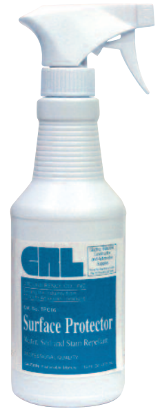
CAT. NO. TPC16

Visit our web site, crlaurence.com , for Application Tips and Most Common Uses. Also Protects Sand-Blasted Glass