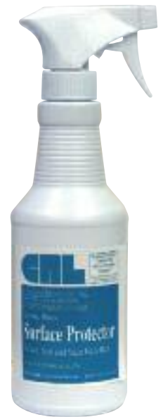
CAT. NO. TPC16

Visit our web site, crlaurence.com , for Application Tips and Most Common Uses. Also Protects Sand-Blasted Glass