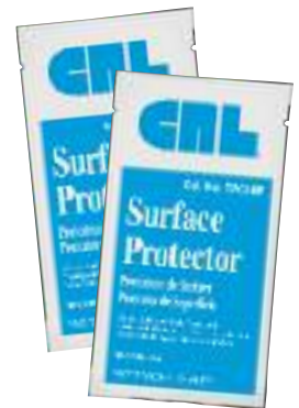
CAT. NO. TPC16P

CRL TPC Surface Protector Towelettes keep your customers coming back. Leave one or two with your customer after each beautiful frameless windscreen installation. Once they see how well CRL TPC Surface Protector keeps their new glass clean, they will be ordering 16 fl. oz. (473 ml) bottles from you. Works well in combination with CRL Bio-Clean Water Stain Remover (see page 589R).