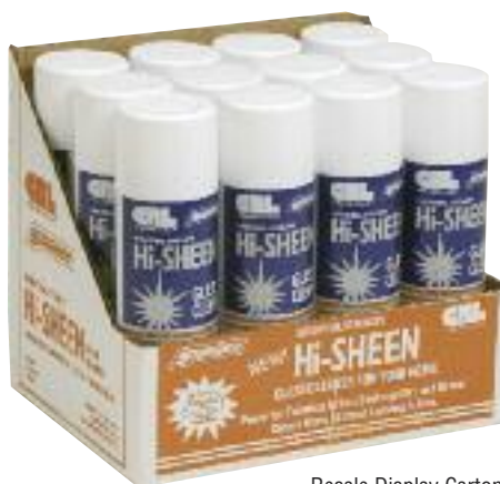
Resale Display Carton

NOTE: Also available with your Logo or Private Label right on the can. Contact CRL Customer Service for details and pricing for this unique service.